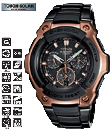
5022 MTG-1000BR-1AER Stainless steel/Resin