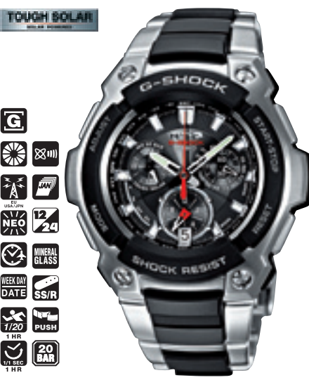
5022 MTG-1000-1AER Stainless steel/Resin