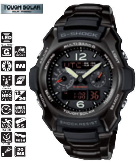
5064 GW-2500BD-1AER Stainless steel/Resin